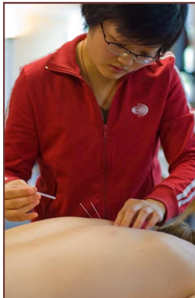
A licensee practices Acupuncture.

OCOM plans to move its campus to downtown Portland in Spring 2012.