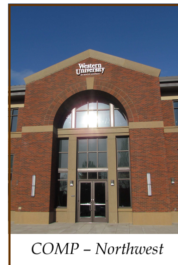
COMP - Northwest

institution. The Lebanon school will occupy a 54,000 square foot building, which will be able to stream lectures and interface with the Pomona campus. +