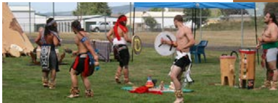
Dancers and drummers from MacLaren YCF supported youth and staff at the Tillamook YCF pow-wow.