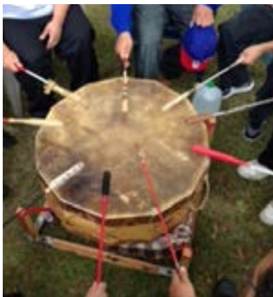
Drummers keep up the beat at the MacLaren YCF pow-wow.