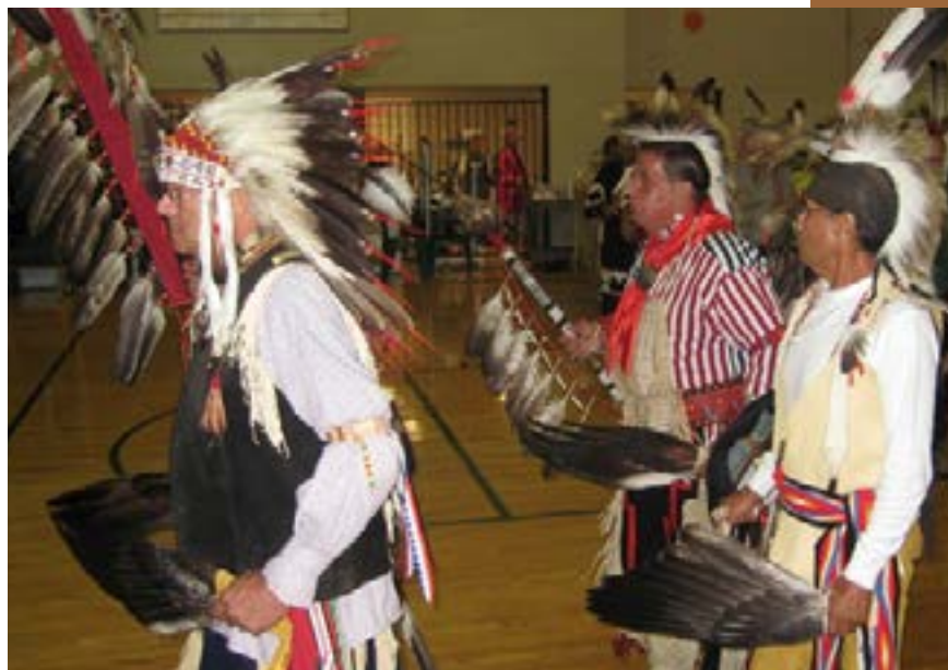
Tribal leaders make their entrance at the Rogue Valley YCF pow-wow.