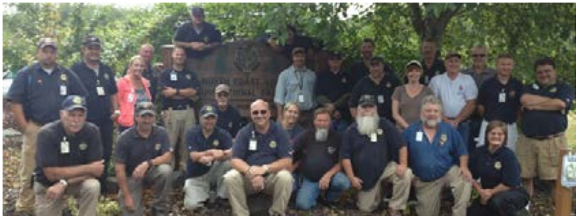
OYA Physical Plant staff met at North Coast YCF in August for team building and repair work.

This month's masthead photo is by Ronald Sandler. You may submit a photo for use as an Inside OYA masthead by e-mailing your photo to oya.communications@oya.state.or.us .