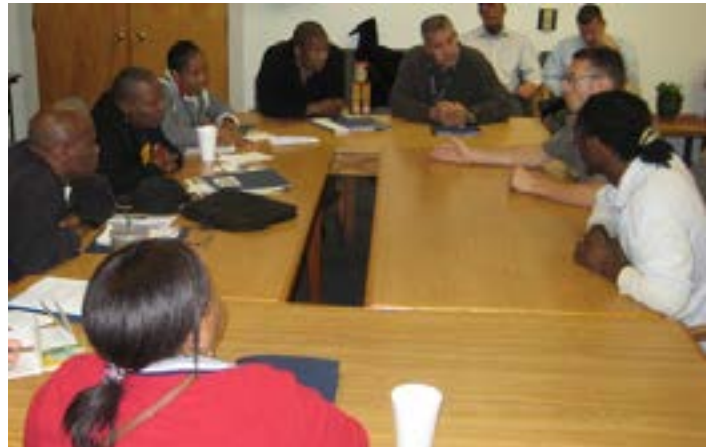
Botswana delegation members listen intently to youth at MacLaren YCF as they discuss their experiences at OYA.

The 10-member delegation consisted of leaders in Botswana’s government. The delegates also visited other sites in the state, including Oregon State Hospital in Salem, over a 2-week period. The trip was organized and sponsored by Transformation Systems International (TSI), a Washington state-based group that builds partnerships with government agencies, businesses and non-profits.