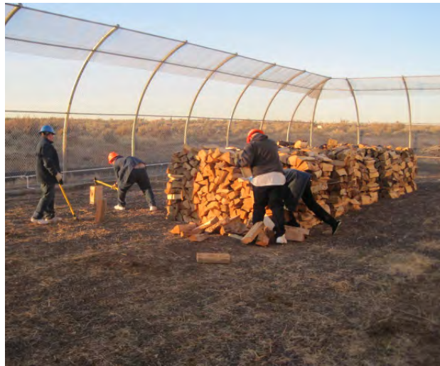
EOYCF youth prepare wood to provide heating fuel for needy individuals in Harney County.