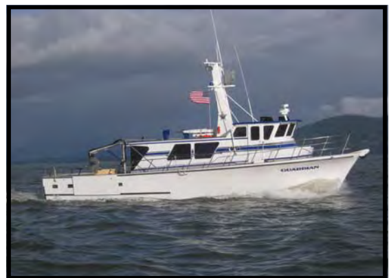
We Are the Guardians of Oregon's Fish and Wildlife

and Wildlife Troopers working from offices located in Astoria, Tillamook, Newport, Florence Newport and Coos Bay. Sport angling and commercial fishing are multi-million dollar industries in Oregon and the Marine team helps to ensure compliance of fishing laws and regulations which sustains fisheries and a prosperous economy in Oregon. He is also in charge of division's patrol vessel, the Guardian.