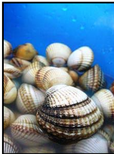
Cockle clams.