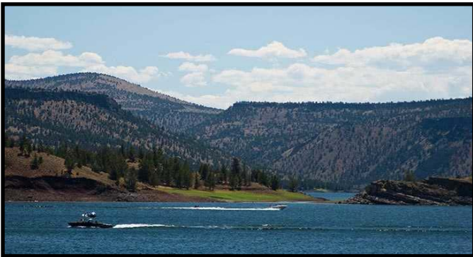
Prineville Reservoir.

Sr. Tpr's. Love and Young conducted a boat patrol of Prineville Reservoir resulting in multiple warnings and two citations for No Angling license .