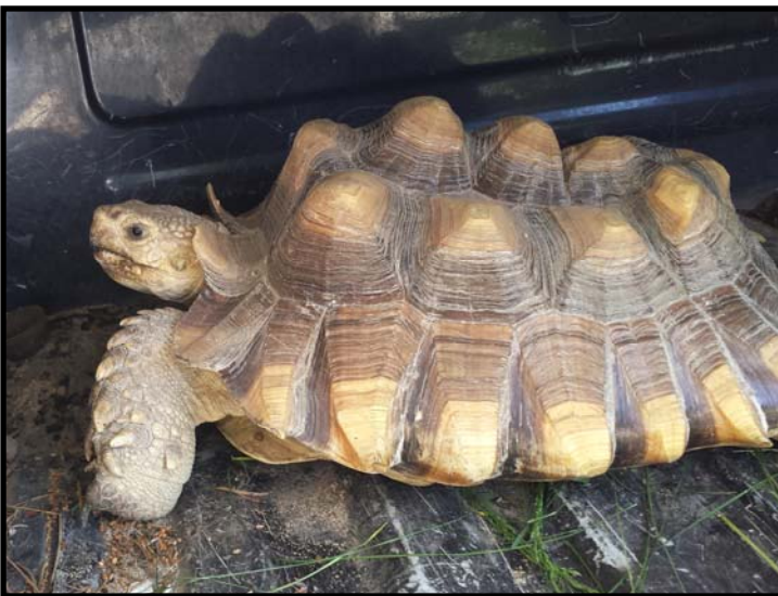
Spurred tortoise.