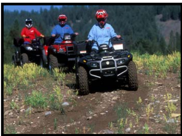
ATV riders.

Sr. Tpr. Hayes contacted three ATV's which were being operated unlawfully without current decals. None of the operators were found to have completed the required safety program and a citation was issued for No Current OHV Decal , with multiple warnings issued.