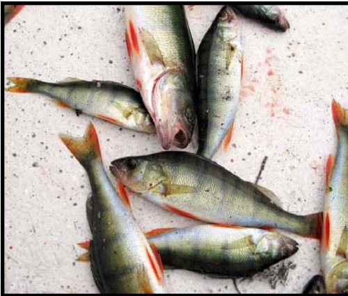
Perch.