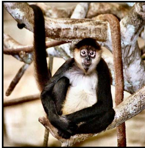
Exotic spider monkey.