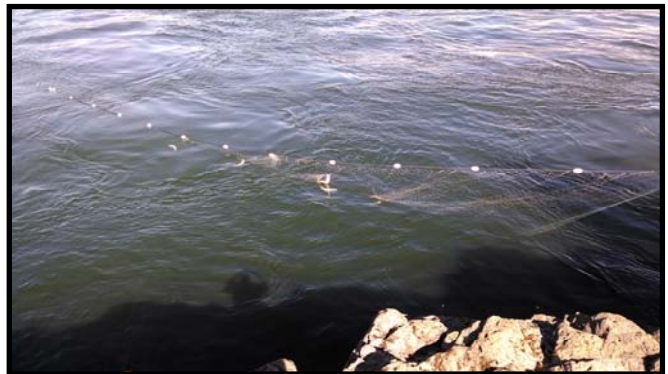
Gill net