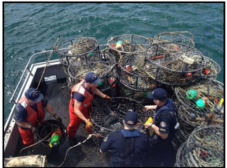
Commercial crab pots.

Tpr. Van Meter contacted a commercial crab boat and cited a deckhand for No Individual Commercial Fishing License .