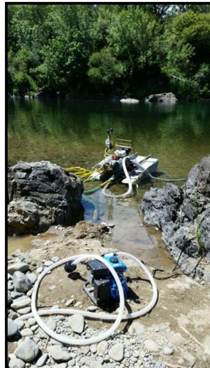
Umpqua River dredge.