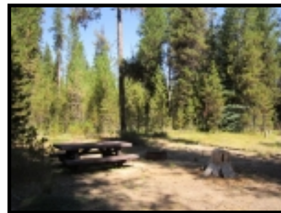
Quinn River Campground.

Sr. Tpr. Ring conducted a traffic stop on a vehicle near Quinn River Campground on Crane Prairie for a speed violation. Upon contact with the operator, Sr. Tpr. Ring could smell an overwhelming odor of green marijuana coming from the vehicle.