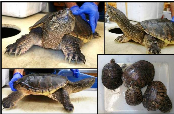
Prohibited turtle species.

Tpr. Imholt received a complaint that a local pet store was in possession of several prohibited species of turtles, including red eared sliders, yellow bellied sliders, musk turtle and a snapping turtle. On a follow up visit, Tpr. Imholt located the prohibited species and contacted ODFW who arrived and helped identify and remove the turtles. A total of 13 turtles were seized from the pet store, some with skin and eye infections and shell rot. These species are prohibited in Oregon because of their ability to easily survive in Oregon waters and out-compete native turtles. The pet store knew they were prohibited and even put up a sign on the tanks stating "Prohibited Species" not for sale. They were using them as an educational tool for the public but had not applied for or obtained the permit to legally do so. The store owner was cited for Possession of Prohibited Species .