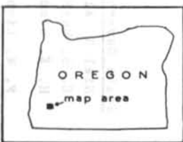
Geology of the area in the vicinity of the Almeda and Silver Peak Mines.