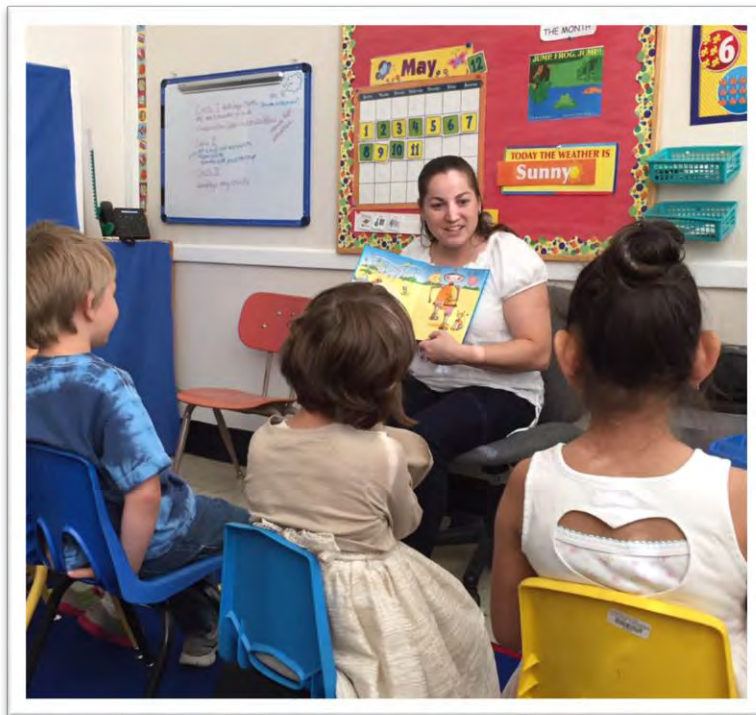
Storytime in Jefferson County.