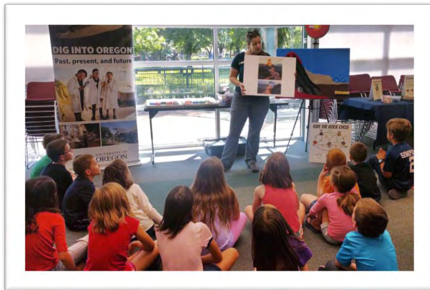
Dig Into Oregon summer program at Baker County Library.