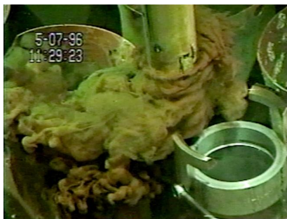
Sludge being stirred up by movement of spent fuel in the K Basins

For example, irradiated nuclear fuel was stored underwater in two basins just a quarter mile from the Columbia River at the K-East and K-West reactors. The fuel was not designed to be stored for an extended period. Over the more than 20 years that it was under water, it corroded, creating a layer of radioactive sludge at the bottom of the basins. In 1994, DOE identified the K-Basins as an urgent priority – as it was determined that an earthquake could damage the basins, causing water to drain. Once exposed to the air, the fuel may have ignited, sending a plume of radioactive materials into the air. It was decided that the best solution was to pack the 105,000 uranium fuel rods and fragments into water filled canisters, move them out of the basin, dry the fuel, repackage it, and move it to an interim storage facility away from the river.