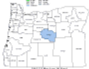
DR-1221 May-June 98 Flood

The images below show the counties effected by Oregon's most recent disaster declarations. Each county is color coded to indicate which federal disaster programs are applicable. There are three major federal disaster assistance programs, Individual Assistance (IA) , Public Assistance (PA) and Hazard Mitigation (HM) . The federal disaster designation, noted by DR, is a unique number assigned by FEMA.