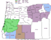
DR-1160 Dec 96-Jan 97 Flood/Landslide