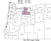
DR-1061 Wasco County Flash Flooding