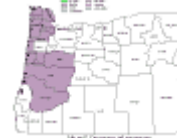
DR-1107 December 1995 Windstorm