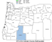
DR-1004 Klamath County Earthquake