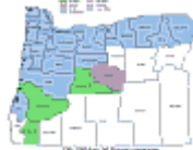
DR-1099 Feb 1996 Flood/Landslide