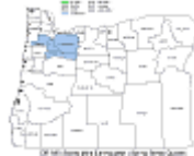
DR-985 Scotts Mills Earthquake