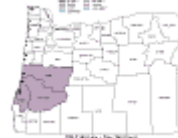
DR-1149 Nov-Dec 96 Flood/Landslide