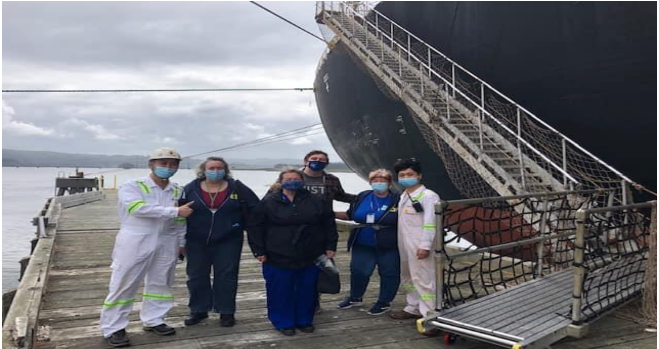
Coos County Staff and Medical Reserve Corp Volunteers Vaccinate a Chinese Cargo Vessel