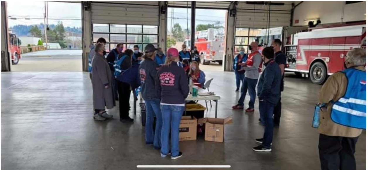
Coos County Staff lead a Mass Distribution Vaccine Event at Coos Bay Fire 2/6/2021. Over 800 Doses of Covid-19 Vaccine were administered in 8 hours.

Report on progress at the Vaccine Equity Committee and our community partners meetings. Include data in future public service announcements and media campaigns. Continue to participate in community groups that actively engage with these communities.