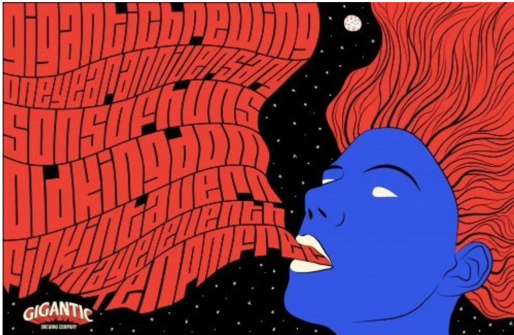
Gigantic Brewing Company's one year anniversary poster. 2010-2019. Multnomah County Library. Retrieved from the Digital Public Library of America, https://dp.la/item/f5bbd247872bc5ef7fb89d24ea62ac64?q=anniversary&partner=%22Northwest+Digital+Heritage%22&page=2 (Accessed April 22, 2022.)

Over the next two years, we plan to bring even more organizations and collections across the Northwest region into the fold, and both Oregon Heritage and the State Library of Oregon are very excited to bring new funding opportunities, a centralized digital repository, and in-person digitization support to Oregon libraries and organizations.