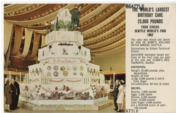
World's Largest Birthday Cake at the World's Fair, 1962. 1962.

This month the State Library of Oregon and its partners, Oregon Heritage and the Washington State Library, are pleased to announce the first anniversary of Northwest Digital Heritage!