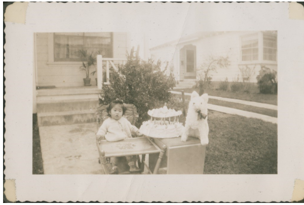
Toddler's birthday. 1940s-1950s.

Over the next two years, we plan to bring even more organizations and collections across the Northwest region into the fold, and both Oregon Heritage and the State Library of Oregon are very excited to bring new funding opportunities, a centralized digital repository, and in-person digitization support to Oregon libraries and organizations.